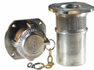
DIP TUBE MANDREL