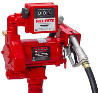
FILL-RITE AC FUEL TRANSFER PUMPS