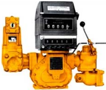
LIQUID CONTROLS (LC) POSITIVE CONTROLS (LC) FLOW METER DISPLACEMENT ROTARY FUEL FLOW METER

Deals in all types of Oil-Field Equipments Gasoline Pumps – Dispensers – Petroleum Hose Pipes – Flow Meters – Filters – Nozzles – Pumps and Electric Motors.