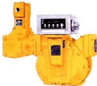
LIQUID CONTROLS (LC) POSITIVE DISPLACEMENT ROTARY WITH PUMP, MOTOR, HOSEPIPE FUEL FLOW MET AND NOZZLE