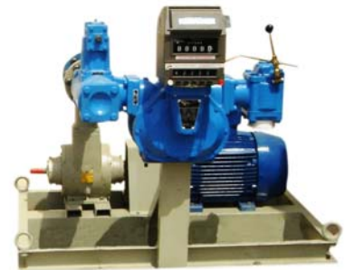
TOTAL CONTROL SYSTEMS (TCS) FLOW METER WITH PUMP AND MOTOR