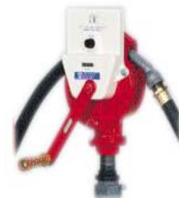
FILL-RITE HAND DRIVEN FUEL TRANSFER PUMPS