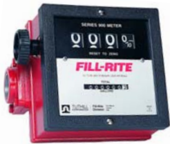
FR-901 FILL-RITE FUEL FLOW METER