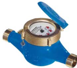
B-METER GMDX - MULTI JET WOLTMANN WATER FLOW METER