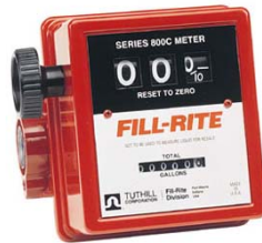
FR-807 FILL-RITE FUEL FLOW METER