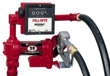
FILL-RITE DC FUEL TRANSFER PUMPS