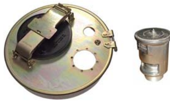
BETTS MANHOLE COVER WITH P.V. VENT