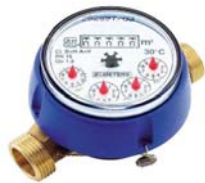
B-METER GSD5 - SINGLE JET WOLTMANN WATER FLOW METER