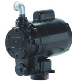
FILL-RITE LUBE OIL TRANSFER PUMP