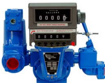
TOTAL CONTROL SYSTEMS (TCS) 700 SERIES POSITIVE DISPLACEMENT ROTARY FUEL FLOW METER