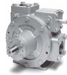
CORKEN ROTARY VANE PUMP