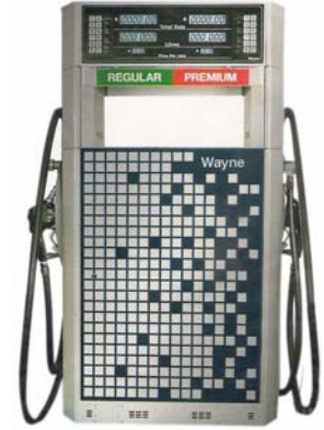
DRESSER WAYNE ELECTRONIC FUEL DISPENSING PUMP