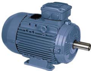
WEG EX-PLSION PROOF ELECTRIC MOTOR