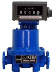
TOTAL CONTROL SYSTEMS (TCS) 682 SERIES PISTON TYPE FUEL FLOW METER