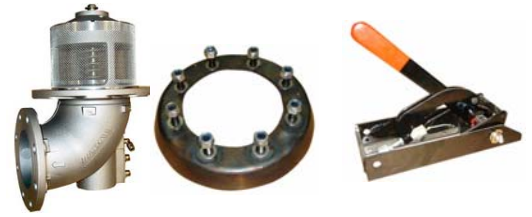
BETTS EMERGENCY VALVE, SUMP AND LEVER