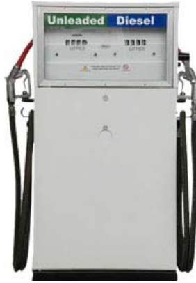
MIDCO MECHANICAL FUEL DISPENSING PUMP WITH HAND DRIVE MECHANISM