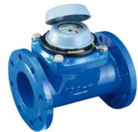
B-METER WDEK-30 WOLTMANN WATER FLOW METER