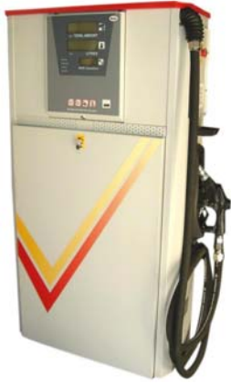
MIDCO ELECTRONIC FUEL DISPENSING PUMP